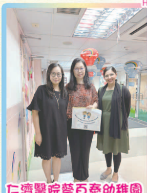
仁濟醫院蔡百泰幼稚園 Yan Chai Hospital Choi Pat Tai Kindergarten