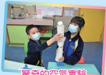
驚奇的空氣實驗 Surprising Air Experiment