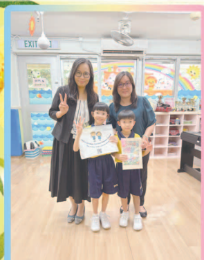
中華基督教會福幼幼稚園 CCC Fuk Yau Kindergarten

Our P1 students were involved in an activity to show their respect for teachers called 'Love with Teachers' in September. Through this opportunity, P1 students wrote about their thankfulness and how they miss their kindergartens and teachers after saying goodbye last summer. Student representatives went to their alma maters and gave thank you cards to the principals to show their thankfulness for all their teaching and caring. This was a fruitful opportunity for all our students.