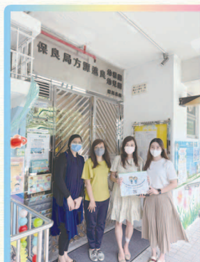
保良局方譚遠良幼稚園 PLK Fong Tam Yuen Leung Kindergarten