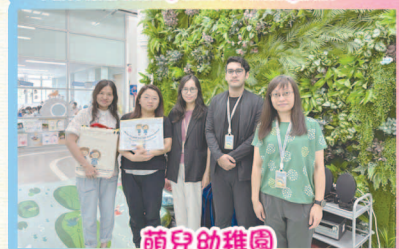
萌兒幼稚園 Moe Kindergarten