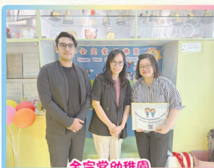
全完堂幼稚園 Chuen Yuen Church Kindergarten