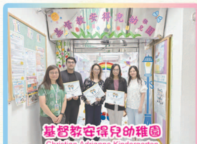
基督教安得兒幼稚園 Christian Adrienne Kindergarten