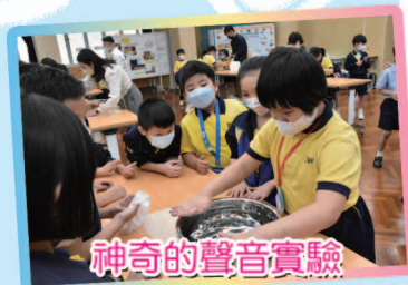
神奇的聲音實驗 Amazing Sound Experiment