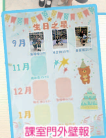
課室門外壁報 The Board outside the Classroom