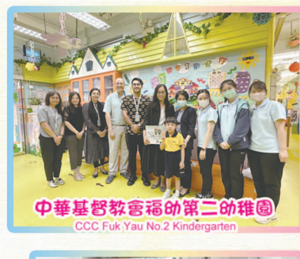
中華基督教會福幼第二幼稚園 CCC Fuk Yau No.2 Kindergarten