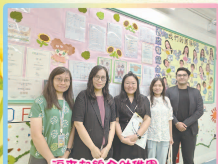
福來邨錦全幼稚園 Fuk Loy Chuen Kam Chuen Kindergarten