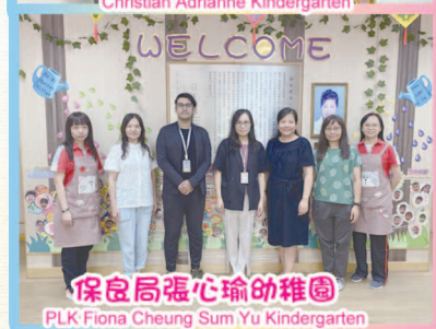
保良局張心瑜幼稚園 PLK Fiona Cheung Sum Yu Kindergarten