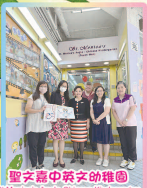
聖文嘉中英文幼稚園 St Monica's Anglo-Chinese Kindergarten (Tsuen Wan)