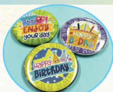
生日襟章 Birthday Badges