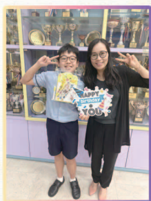
生日祝福角 Birthday Blessings Corner