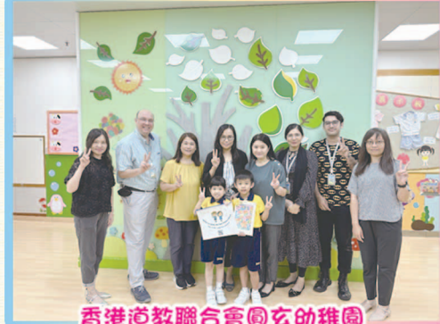
香港道教聯合會圓玄幼稚園 HK Taoist Association Yuen Yuen Kindergarten