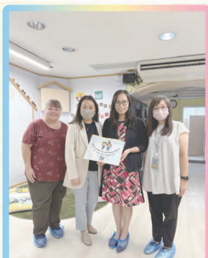
聖安多尼中英文幼稚園 St. Anthony's Kindergarten